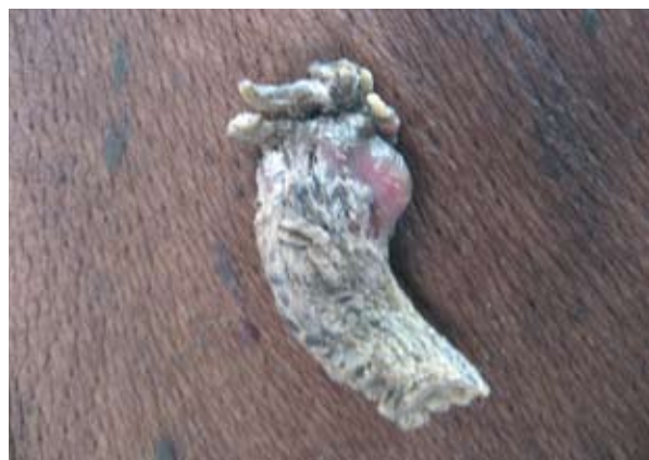
Fig. 1. Cutaneous horn on the back resembling a fingernail; a yellowish-whitish, curved 4 cm protrusion, representing a keratoacanthoma.

Cutaneous horns are generally evident as elongated, keratinous, white or yellowish projections that range from a few millimeters to several centimeters in size (12–13). As Kaposi (14) thoroughly described them over a century ago, they can be variable in size and form, such as cylindrical, conical, pointed, corrugated transversely and longitudinally, or curved like a ram's horn. They are solitary, growing slowly over years to decades if left alone (13, 15, 16). They are rarely seen greater than 1 cm in length in clinical practice due to their slow-growing nature and early removal. Growth may also be disrupted by trauma. However, cutaneous horns as long as 25 cm have been described (16). The base of the horn may be flat, nodular, or crateriform (12). Surrounding inflammation and an infiltrated base are unusual, but they may indicate malignancy if present (15). Tenderness at the base also favors malignancy (12). Cutaneous horns may be confused with conditions such as ectopic nail (17), which the cutaneous horn on the back of a 92-year-old African-American man shown here strongly resembled (Figure 1).